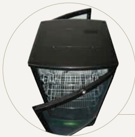
Double lockable curved doors