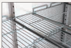
Bridge between shelves for maximum use of space