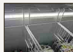
LED internal light