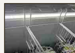
LED internal light